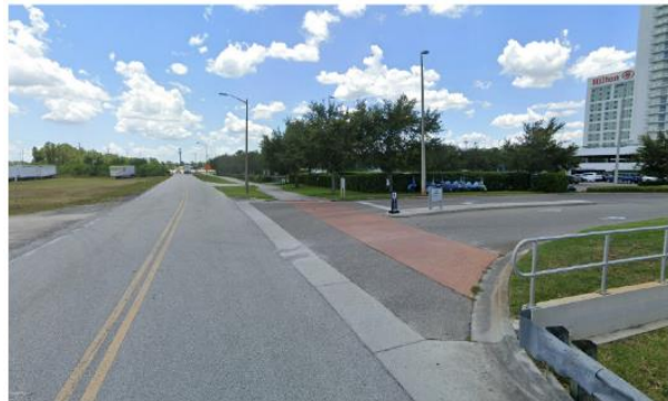
Tradeshow Boulevard looking south.

TRADESHOW BOULEVARD & KIRKMAN ROAD EXTENSION: Included as part of the International Drive Transit Feasibility and Alternative Technology Assessment (TFATA) was an evaluation of the potential to implement improvements to Tradeshow Boulevard, to include the addition of vehicular travel lanes and transit lanes between Destination Parkway and Universal Boulevard. Kirkman Road is under construction and extends south of Sand Lake Road and will end at the intersection of Tradeshow